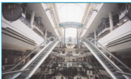
British Land Plc, Eastgate Shopping Centre, Basildon Project managing remodelling and refurbishment scheme - £6m.

Below is a selection of projects illustrating our experience in this area.