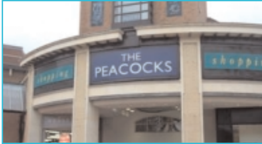
British Land Plc, The Peacocks Centre, Woking Remodelling and Project Management Services.