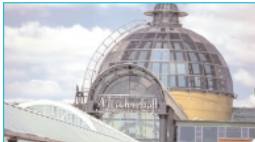
British Land Plc, Meadowhall Centre, Sheffield Pre-acquisition survey, Project Management of refurbishment works.

Supremely aware of the need to keep our clients informed, Colliers CRE and Colliers International release many explanatory publications regarding the European market and organise regular conferences. The Building Consultancy Division similarly release many publications and guidance notes – all of which can be viewed on, and downloaded from our website (see below).