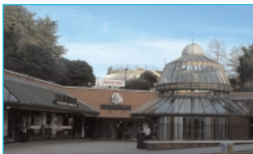
Friends Provident, Castle Mall, Norwich Quantity Surveying Services, £100m development.