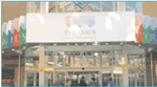
Norwich Union Milner Retail Partnership Pyramid Shopping Centre, Birkenhead Project Management, Quantity Surveying, Planning Supervision. Upgrading works - £1m.