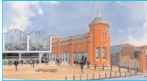
AWG Milln Gate (Stockport) Limited The Courts, Stockport. Feasibility and Quantity Surveying advice - £8m development