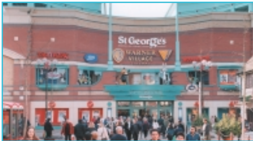
Delancey Estates, St Georges Shopping Centre Project Management, refurbishment and remodelling. Upgrading works - £1m.