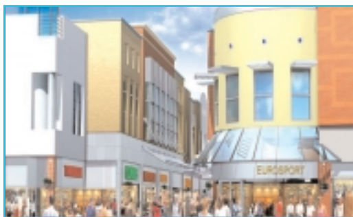
Ashcroft, Vancouver Shopping Centre, Kings Lynn Party Wall, Rights of Light and unit remodelling advice.