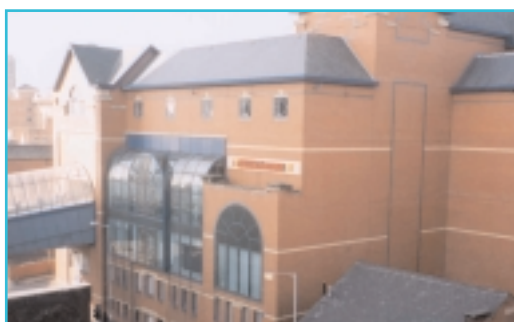
Dawnay Day, The Wheatsheaf Centre, Rochdale Pre-acquisition survey of centre and feasibility studies.