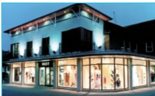
Delancey Estates, King Edward Court, Windsor Project Management, remodelling and refurbishment of centre.