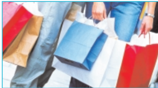
Speciality Shops Plc, Waverley, Shopping Centre, Edinburgh Capital Tax Analysis, Project Management and Quantity Surveying Services - £3m refurbishment.